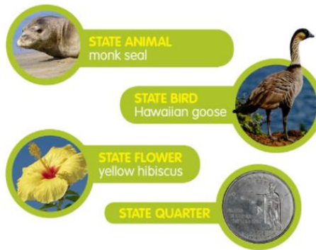
RIGHT: HAWAII STATE SYMBOLS